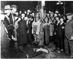
Apr 25-1:36 PM